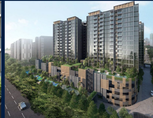
4 - Bedroom